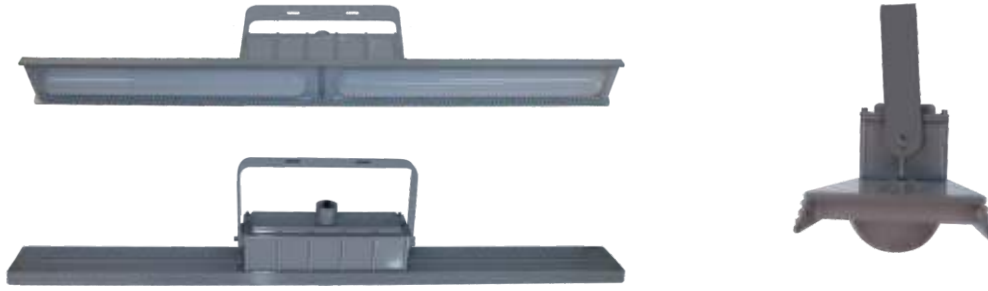
2FT/4FT Linear High Bay