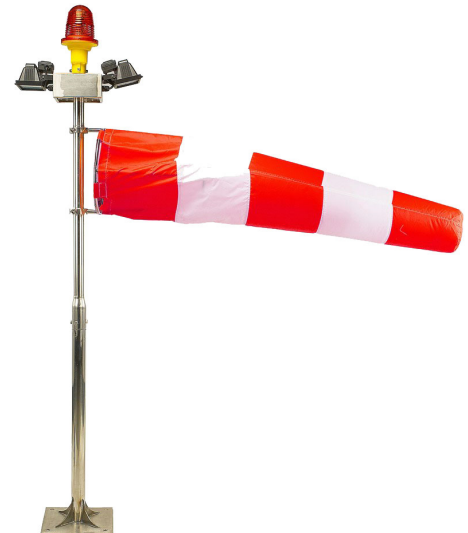
External Illumination Type